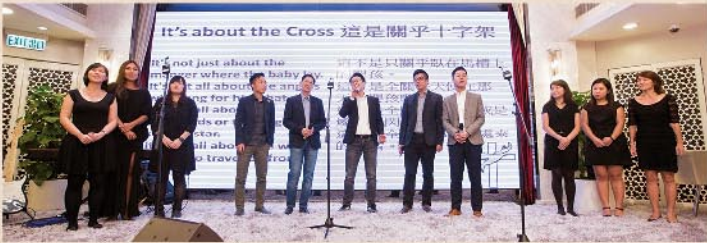
Island Evangelical Community Church 的 IGlee 表演歌詠及 A Cappella.