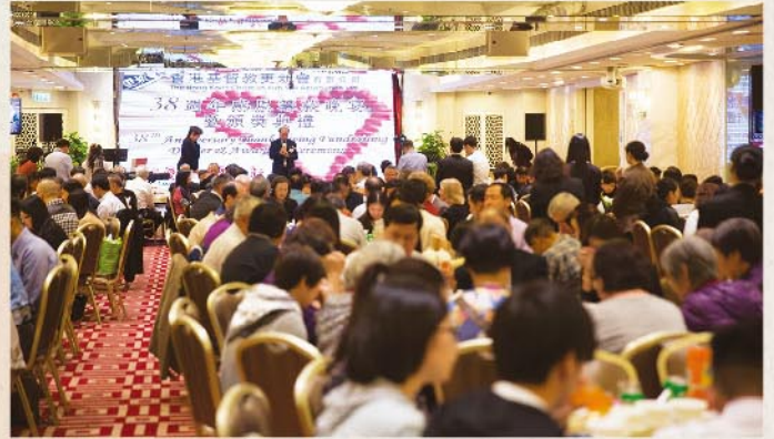
We invited over 170 rehabilitated brothers and sisters and their family members to join our Anniversary dinner. Thank you so much for your donation to enable them to come. Reunion with them seeing their changes and God's grace in their lives, was just so touching!