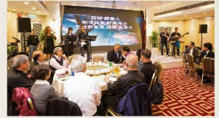
Rehabilitated brothers and sisters formed a music group to lead worship.