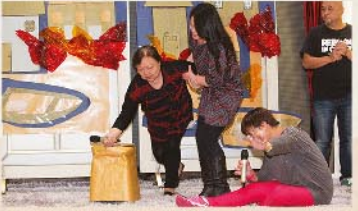
Students from Onesimus performed a drama to share their story.