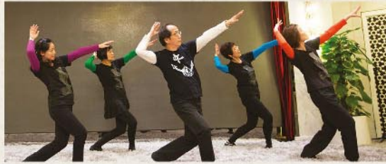
Devotional dance by Gospel Devotional Dance Team from The Methodist Church, Hong Kong.