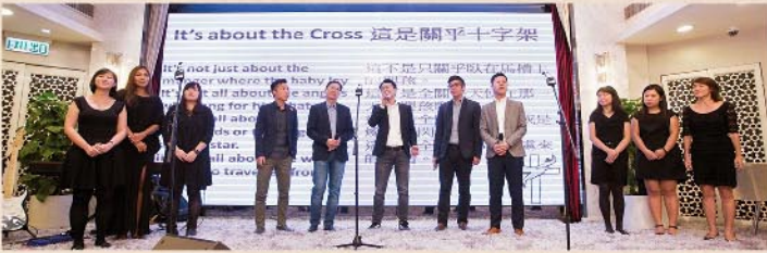
Wonderful songs and A Cappella by IGlee from Island Evangelical Community Church.