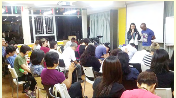
An other nations rehabilitated persons share at volunteer training

When the inmates are released we changed our physical fellowship to online fellowship as started during the pandemic as we could continue to meet with those who want to continue to grow in faith who have returned back to their home countries but truly want to be used by the Lord in their family and communities. The fellowship provides accountability as members walk together as the family of Christ to help each other achieve their personal as well as spiritual goals in order to be lights to the ends of the earth.