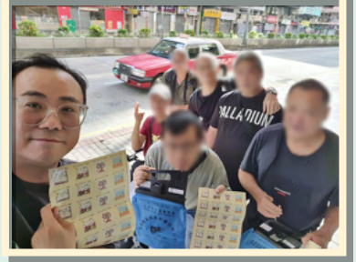
男女宿舍舍友努力幫忙賣旗 The hostel's member worked very hard on Flag Day