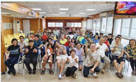
Mission Team and the "Exist for Love"

Onesimus Training Scheme trainee, currently working in the female dormitory of KSA