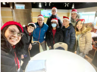
Christmas Evangelism Volunteer Team