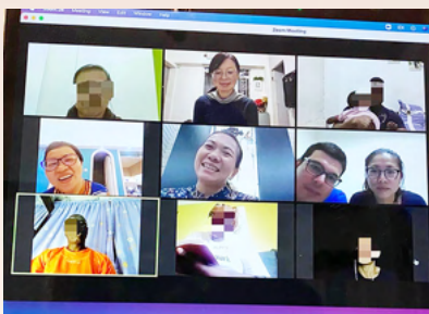
An on-line Seeds Fellowship for other nations rehabilitated persons