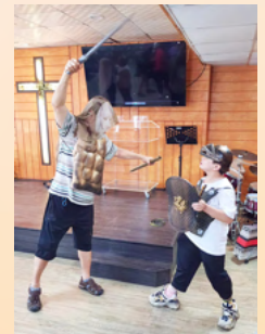
Drama "The Victory Stone"

This was my first time participating in a short-term mission, which expanded my horizons and taught me about working as a team in everything we do. Seeing the residents delighted with even the smallest things made me reflect on cherishing all that I have. Knowing that Exist For Love is moving to a new location, I pray for the Lord's guidance, blessings, and provision!