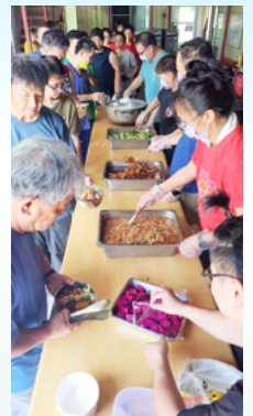
Serving the members of the "Exist for Love"

Exist For Love has become a place where I find rejuvenation. This upcoming trip feels like a confirmation of my decision to serve God, reminiscent of the day of my calling. Currently preparing for further studies, uncertain of what the future holds, I am willing to respond to God's call and am grateful for His affirmation and love. I aspire to become a better version of myself, one that God can use for His purposes. I eagerly anticipate embarking on another short-term mission journey with the Onesimus team once again.