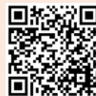
自動轉賬表格 Auto-payment form